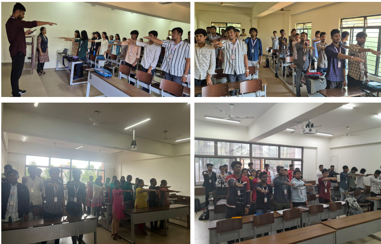
Sample pictures of students taking pledge on Swachh Bharat Abhiyaan Under EBSB from various departments

The Ek Bharat Shreshtha Bharat initiative encourages students to appreciate India's unity in diversity. During this activity, students exchanged ideas and experiences, blending regional strengths to embody the initiative's vision. This not only deepened their understanding of India's cultural heritage but also promoted inclusivity and mutual respect. Participation in such activities enriched students' academic excellence while broadening their perspectives for personal and professional growth.